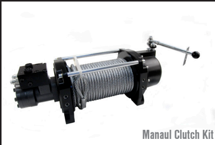
Manual Clutch Kit